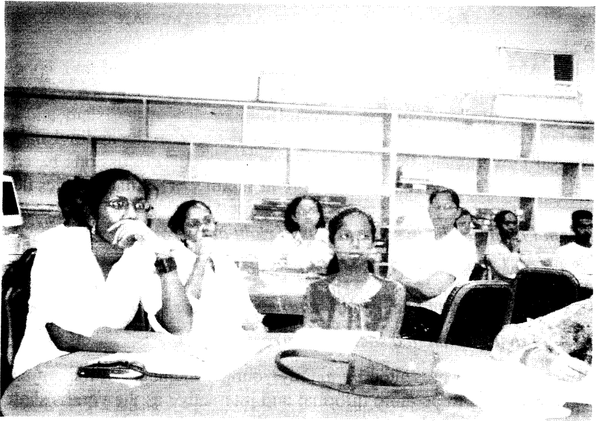
Ahmadi Youths in Conference (July 17, 2004)