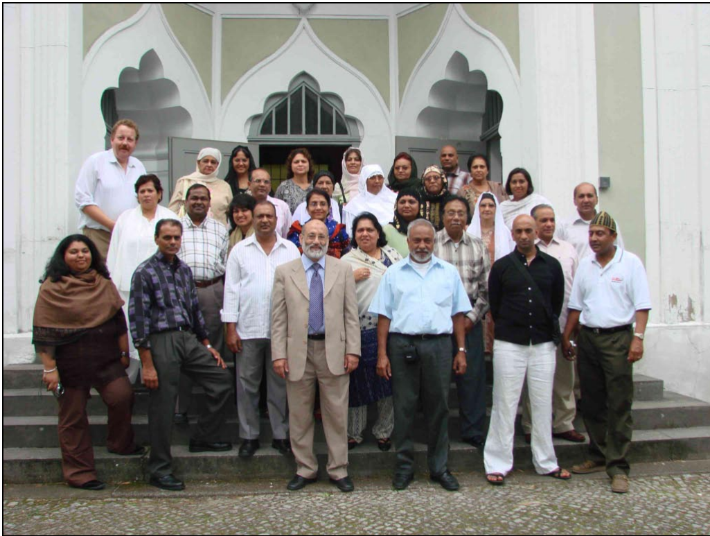
Above: Outside the Berlin Mosque, with a group from Holland